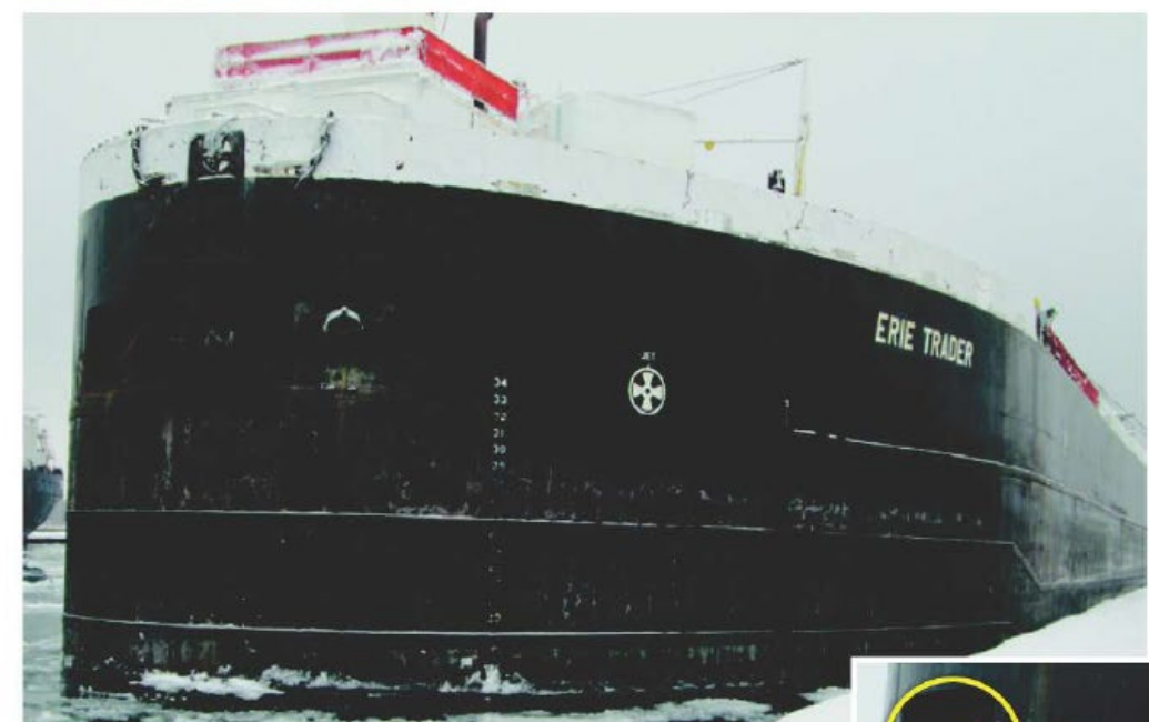
Figure 60. The bow of barge Erie Trader after the accident. At right: the remnant shank of the starboard anchor in the anchor pocket is highlighted.

On March 30, the ATB began its second voyage of the season, from Duluth to Indiana Harbor, Indiana. During the voyage, the ABs, who were responsible for clearing and securing the anchors, believed the starboard anchor was still out of service awaiting repair. The anchors were first ordered cleared on March 31, when the vessel passed Gros Cap Reef for the transit through the Soo Locks and St. Marys River. However, the AB on watch at that time stated he did not clear the starboard anchor because he had an understanding with the other AB to not clear it.